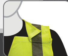
Hook & Loop Closure at Front of Shoulder